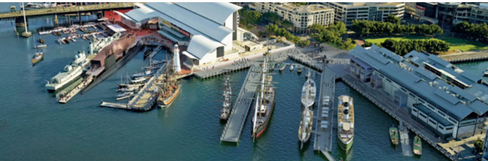
Maritime Heritage Precinct Marina (artist's impression - north east view) - Indicative only

The NSW Government is proposing to construct a marina consisting of two new wharves, pontoons and a small vessel facility next to the Australian National Maritime Museum in Pyrmont Bay to showcase the operational Sydney Heritage Fleet vessels.