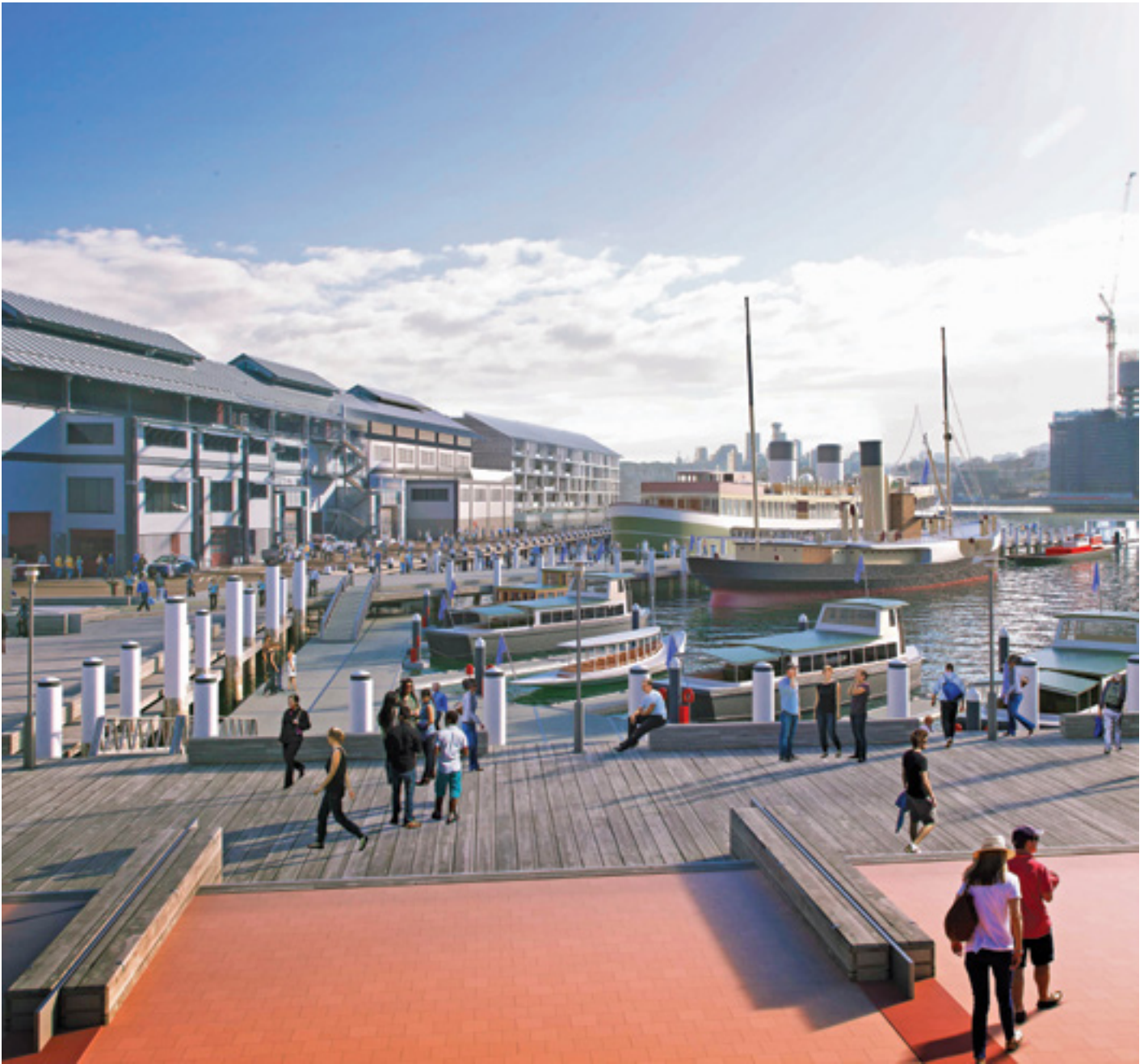
Maritime Heritage Precinct Marina (artist's impression – view from south) – Indicative only