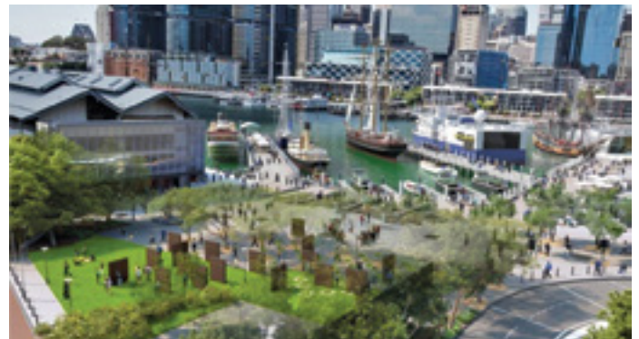
Maritime Heritage Precinct Marina (artist's impression – south west view) – Indicative only

If you need help understanding this information, please contact the Translating and Interpreting Service on 131 450 and ask them to call us on 1800 370 857.