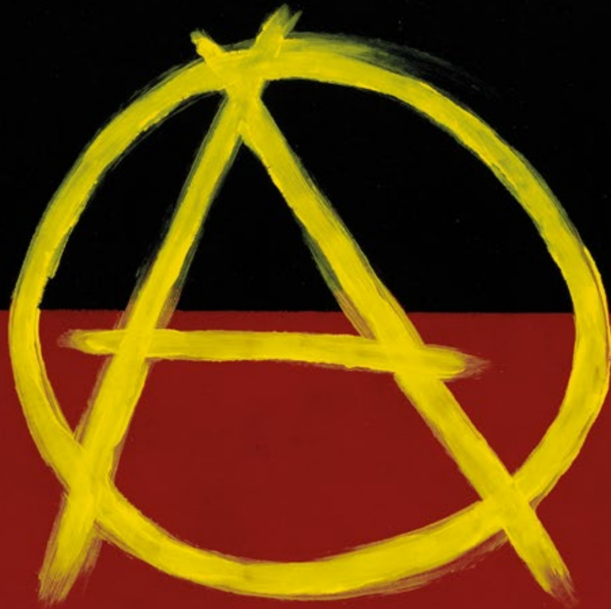
↑ Archie Moore, Aboriginal Anarchy , 2012. National Gallery of Australia, Canberra. Purchased 2013.

We defy: By existing; By determining our identity; By asserting our histories; our culture; our language; By telling our stories, our way; By being one of the oldest continuous living cultures in the world.