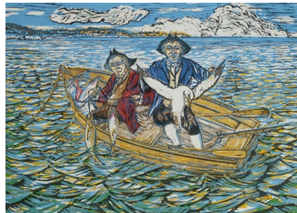
↑ John McLean, Solander and Banks Bag Fish and Fowl , 2019, woodblock. Courtesy of the artist and Solander Gallery.