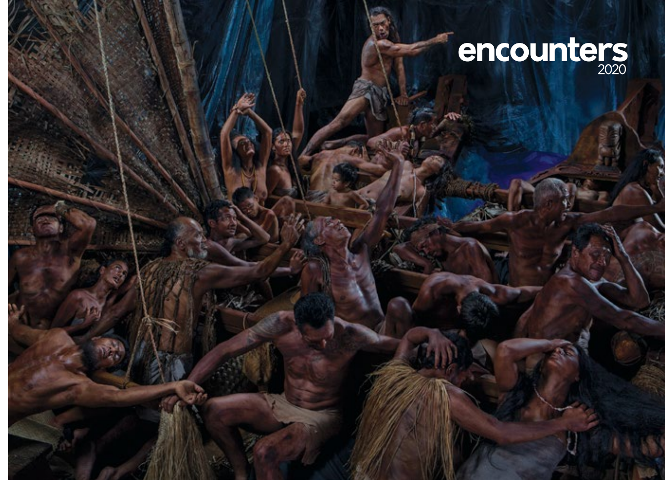
↑ Greg Semu, The Arrival , 2014-15 (detail). C type photograph.

Produced by the Australian National Maritime Museum.