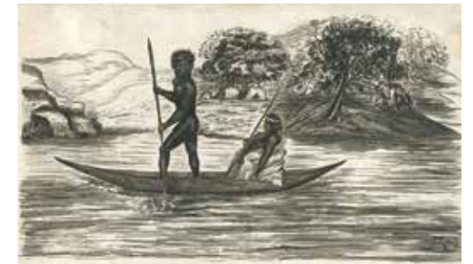
Scene on Mitta Mitta River (above)