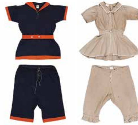
Women's swimwear 1900–1940s (above) (ex-Auburn District Historical Society Collection)